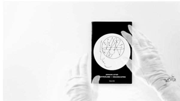
Dvd cover - Bernhard Leitner