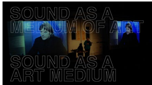
Steina Vasulka - Performance in Reykjavik 2012