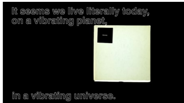
Catalogue for the «Sound» exhibition New York 1969