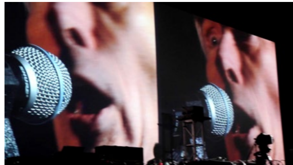
Jaap Blonk - Performance in Shanghai 2014