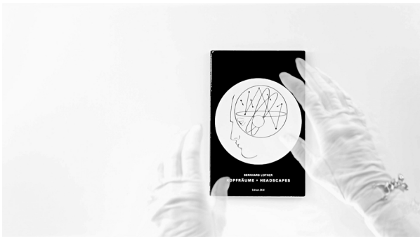
Dvd cover - Bernhard Leitner