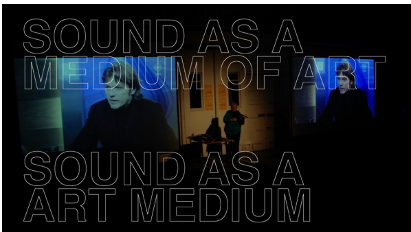
Steina Vasulka - Performance in Reykjavik 2012