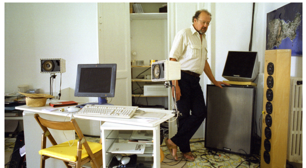
Max Neuhaus - Capri studio 2003