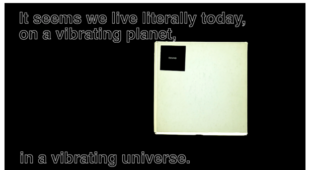
Catalogue for the «Sound» exhibition New York 1969